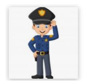
Question 3 : Who is this?