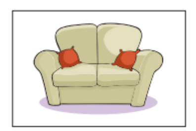
Question 2 : What is this?